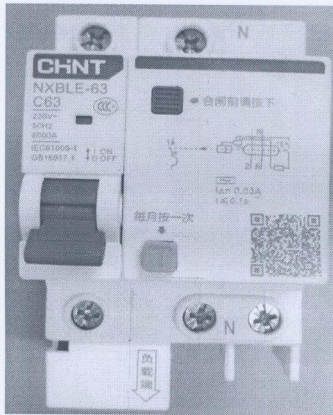
Images of NXBLE-63

Signed for and on behalf of Zhejiang CHINT Electrics Co., Ltd. — Chint Industrial Zone, August 15, 2017