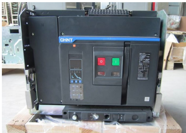
Images of NXA series