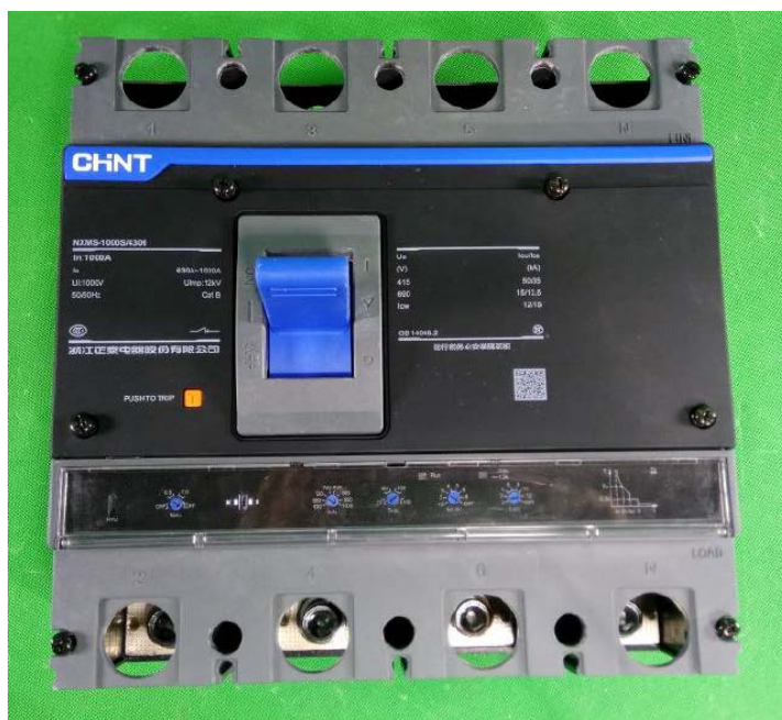
Images of NXMS-1000S